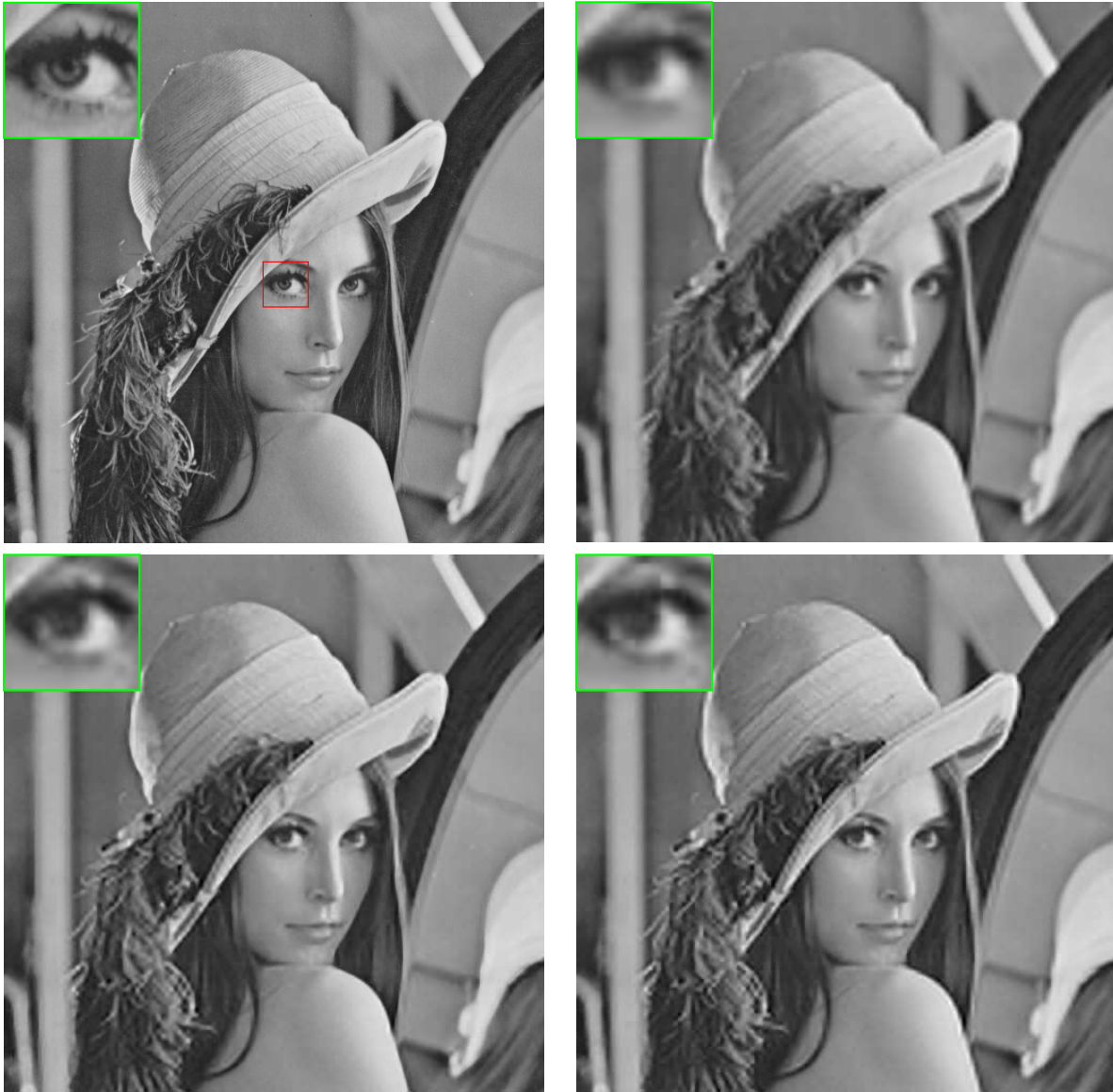
Fig. 3. Results of the Lenna image magnified by a factor of s = 4 . Top-row (left to right): the original HR image, bicubic interpolation (RMSE: 9.21); bottom-row (left to right): Yang's method [8] (RMSE: 7.81), our method (RMSE: 8.18).