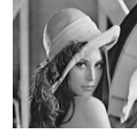
(a) LR input