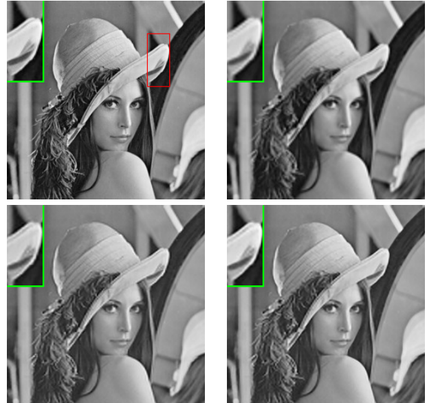
(b) HR output